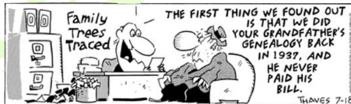
FRANK AND ERNEST